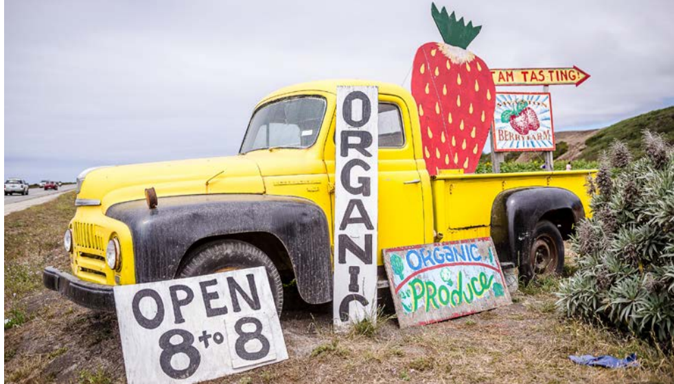
A U-pick farm in Santa Cruz County. Visitor demand to visit farms increased significantly during the pandemic.

Increased public demand did not always equate to increased revenue or an increase in total visitors. The