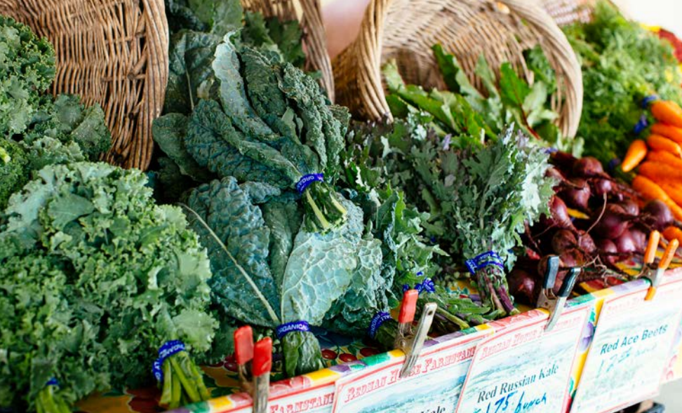
On-farm direct-to-consumer sales were an important part of farmers' businesses during the COVID-19 pandemic.