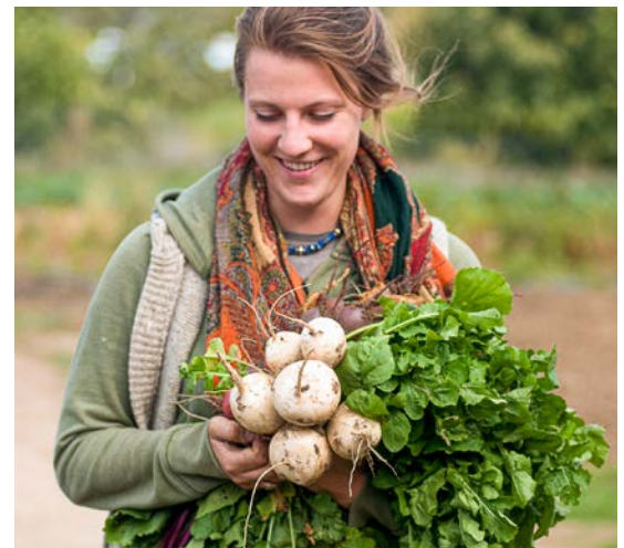
A young woman carrying freshly picked root vegetables.

In response to the disruptions in farm operations and the increased public interest in agritourism activities seen in the first several months of the pandemic, the UC ANR Agritourism Program launched a project