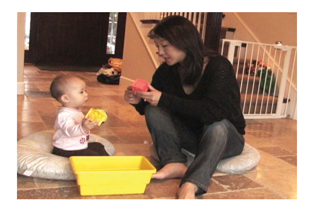
FIGURE 4 Example of infant and mother in free play interaction at 12 months, from which maternal speech counts were derived. (Color figure available online.)

Maternal Speech. To assess and control for possible caregiver effects on vocabulary, (i.e., quantity and diversity of lexical input), maternal language to infants during a play session was transcribed. During the visit to the dyad's home when the infants were 12 months old, infants and mothers engaged in approximately 12 minutes of unscripted ("free") play. Dyads were video-recorded while playing on the floor with a set of infant toys provided by the experimenter (Figure 4). Thus, objects that served as potential referents of maternal speech were controlled across dyads. Maternal speech was transcribed off-line using ELAN software (http://www.lat-mpi.eu/tools/elan/; Sloetjes & Wittenburg, 2008).