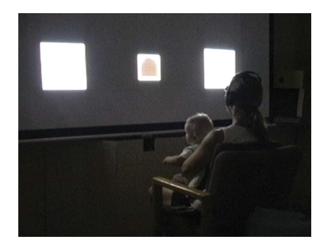
FIGURE 1 Infant sitting on mother's lap, viewing the three image locations, with a center cue displayed. (Color figure available online.)

camera captured the infant's face. Another experimenter (E2) in an adjacent control room monitored the infant's face, and began the program to present stimuli and record infants' responses.