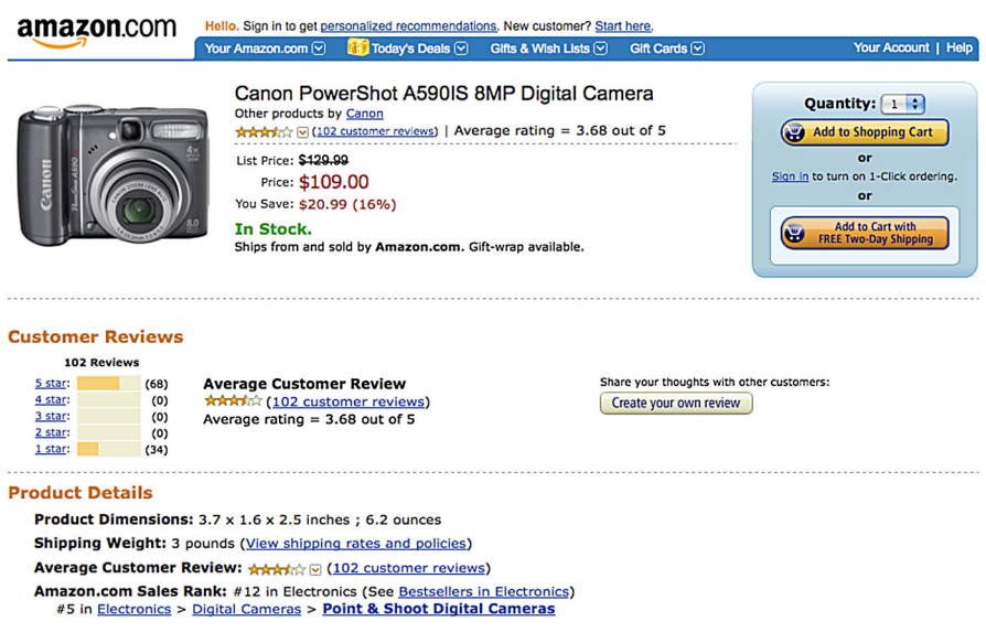
Fig. 1 Example product web page