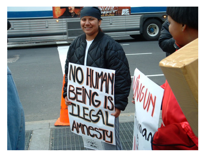
FIGURE 4. Young participant holds a sign at the Viacrucis of the Immigrant, April 2003, New York City.

In the spring of 2010, a group of five undocumented youth activists from several states occupied the offices of Senator John McCain (R-AZ) in Phoenix, Arizona. They risked arrest and deportation as a result of their civil disobedience. The activists, and others that soon followed in other parts of the country, declared themselves "undocumented, unafraid, and unapologetic." This willingness to be open and visible