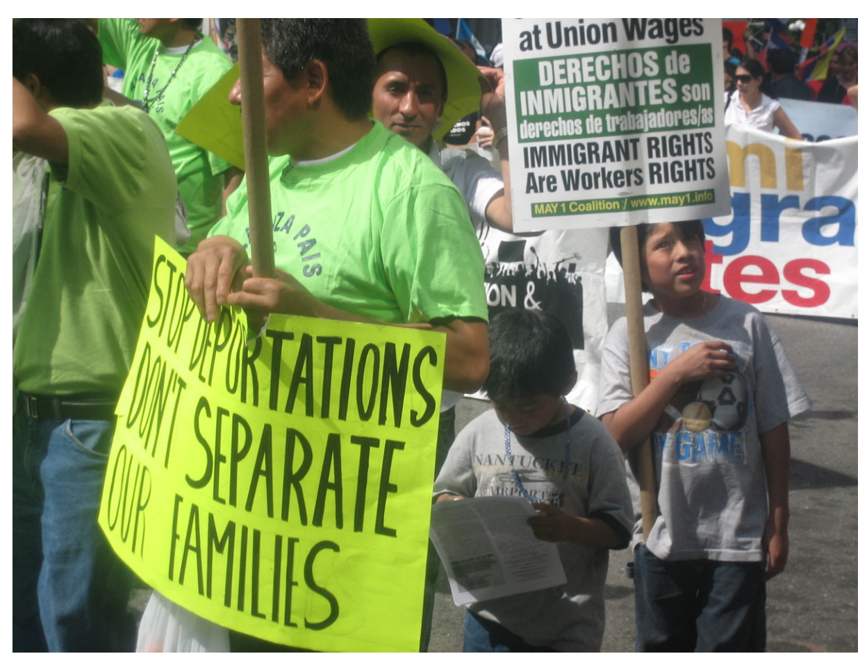
FIGURE 2. Father and children protest deportations and demand rights at immigration reform rally in New York City, May 1, 2010.

and other players instrumental in the U.S. security establishment discuss "the border," they are clearly referring to the international boundary between the United States and Mexico—not the U.S.-Canadian border nor the territorial waters of the United States (Plascencia 2012). Such sensibilities are inextricably linked to a profound sense that this particular international boundary is out of control. And such sensibilities emerge in spite of several thousands of new Border Patrol agents, the deployments of the National Guard, the use of cutting-edge technology such as drones in the skies of the southwestern United States, and the increasing reports of official shootings and extraofficial hunting of the undocumented—all of this occurring in an epoch of plummeting undocumented border crossings. Indeed, the U.S. military establishment and defense contractors increasingly promote military tactics, strategies, and technology in the arena of border enforcement. Meanwhile, thousands of the undocumented have died trying to cross into the United States or remain undiscovered in the steep hills and ovenlike heat of the killing deserts of the southwestern United States since the late 1990s.