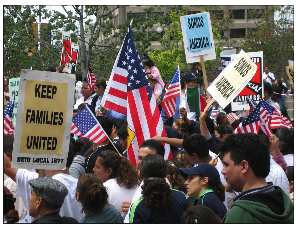
FIGURE 1. Immigrant rights demonstration, May 1, 2006, Santa Ana, California.

News stories that receive intense media attention become media spectacles that produce what becomes takenfor-granted knowledge about people: for example, gay men and lesbians, undocumented immigrants, feminists, even students who go wild on spring break (Kellner 2003). Media attention on the relatively newly constructed term anchor baby is a case in point. Michelle Malkin, a regular on Fox News, linked birthright citizenship to undocumented immigration and to post-9/11 fears of terrorism. Ironically, Michelle Malkin's Filipino parents were in the United States on student visas, making her an anchor baby. Lou Dobbs, then on CNN television, helped make anchor babies a household phrase, emphasizing their part in a plot by their parents to gain U.S. citizenship. Senator Lindsey Graham said, "People come here to have babies. They come here to drop a child. It's called drop and leave" (Barr 2010). Linguistic anthropologists emphasize that referring to humans using language reserved for animals—cats, horses, and so forth that "drop" litters or foals—symbolically and metaphorically associates people with animals; this thus allows Graham to both dismiss the women's humanity and underscore the need to deny them birthright citizenship (Santa Ana 2002).