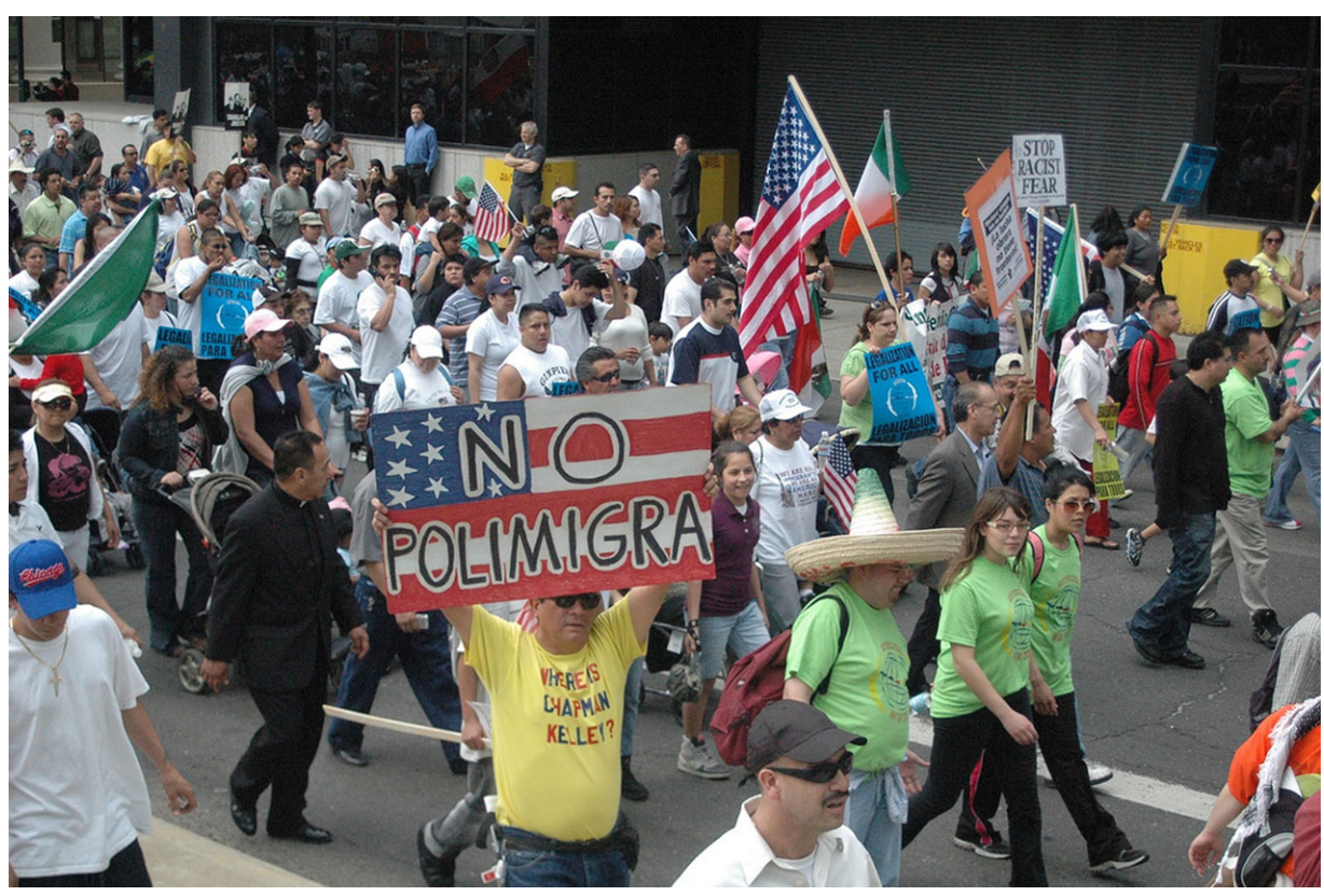
FIGURE 5. Photo from Chicago May Day immigration march on May 1, 2008. This image features a sign with the U.S.-based Spanish language term polimgra, a neologism that captures emergent collaborations among local, state, and federal authorities in immigration enforcement efforts. In addition to denouncing these efforts, the sign also challenges presumptions about the relationship between language and national identity.

being is illegal" and "Don't deport my mom." At lengthy meetings of immigrant rights organizations, children often accompanied their parents. In one particularly memorable meeting, a group of three seven- to nine-year-old boys sat in a straight line of chairs in the back of the room, imitating every gesture, head nod, and facial expression made by their fathers—the executive officers of the group—as they led the meeting. At another site, older siblings regularly administered homework help, entertainment, and snacks to younger children while their mothers conducted meetings (Gálvez 2009).