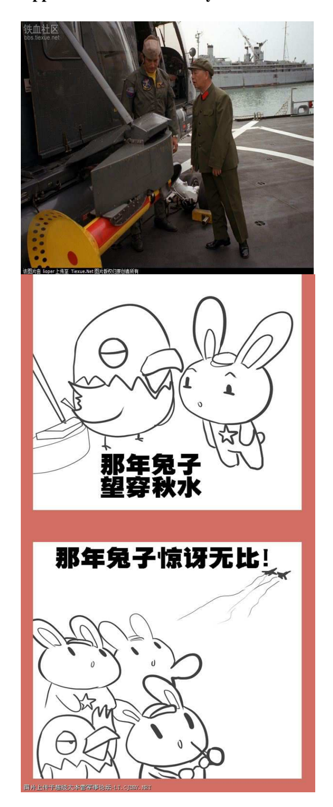
Appendix 4.2: "That Bunny in Those Years"

Source: "Gei Zhezhang Tu Peide Nanian Natu de Tu Shui You?" (Who Has the Picture in 'That Bunny in Those Years' that Matches this Photo?), <a href="http://www.newsmth.net/bbstcon.php?board=MilitaryJoke&gid=220230">http://www.newsmth.net/bbstcon.php?board=MilitaryJoke&gid=220230</a>; "Xinsuan Ah, Kanle Ni Jiu Mingbai Zhongguo Weishenme Yao Jian Hangma Le" (So Bitter! You Will Understand Why China Needs Air Carrier after Seeing This Picture," <a href="http://www.mitbbs.com/article_t/Military/38453741.html">http://www.mitbbs.com/article_t/Military/38453741.html</a>, both retrieved September 26, 2012.