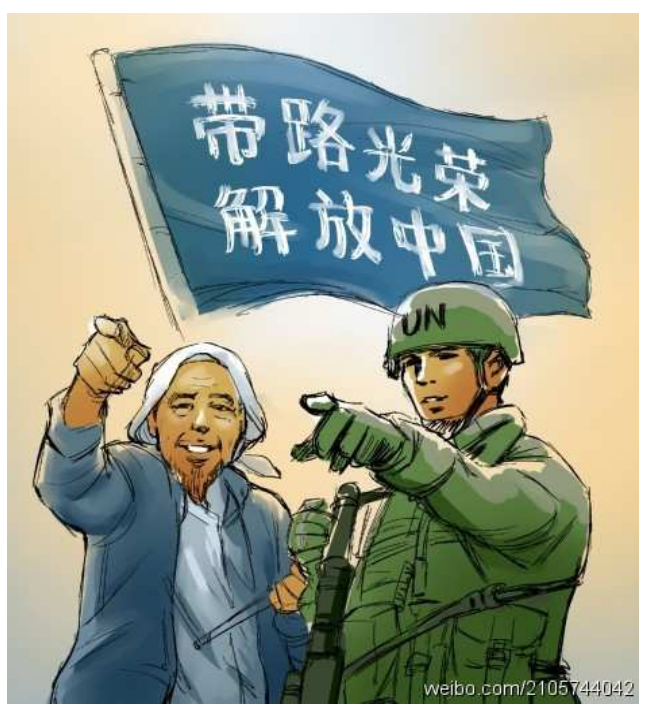
Appendix 6.4: Dailu Dang (Road-Leading Party)

The comic depicts a farmer – invokes the image of elderly farmers in China's anti-Japanese War effort who fought fiercely against the invaders – guiding a UN soldier. The two lines on the blue flag are "Leading the way (for foreign intervention) is glorious" and "Liberate China" respectively. Original source: weibo.com/2105744042. The picture has been deleted from its original source but spread widely circulated on forums. For an example of nationalistic responses and debates, see "Dailu Dang, Yige Lingren Exin de Qunti" (Road-Leading Party: A Sick Group of People), <a href="https://bbs.tiexue.net/post/5107937">https://bbs.tiexue.net/post/5107937</a> 1.html, retrieved July 20, 2012.