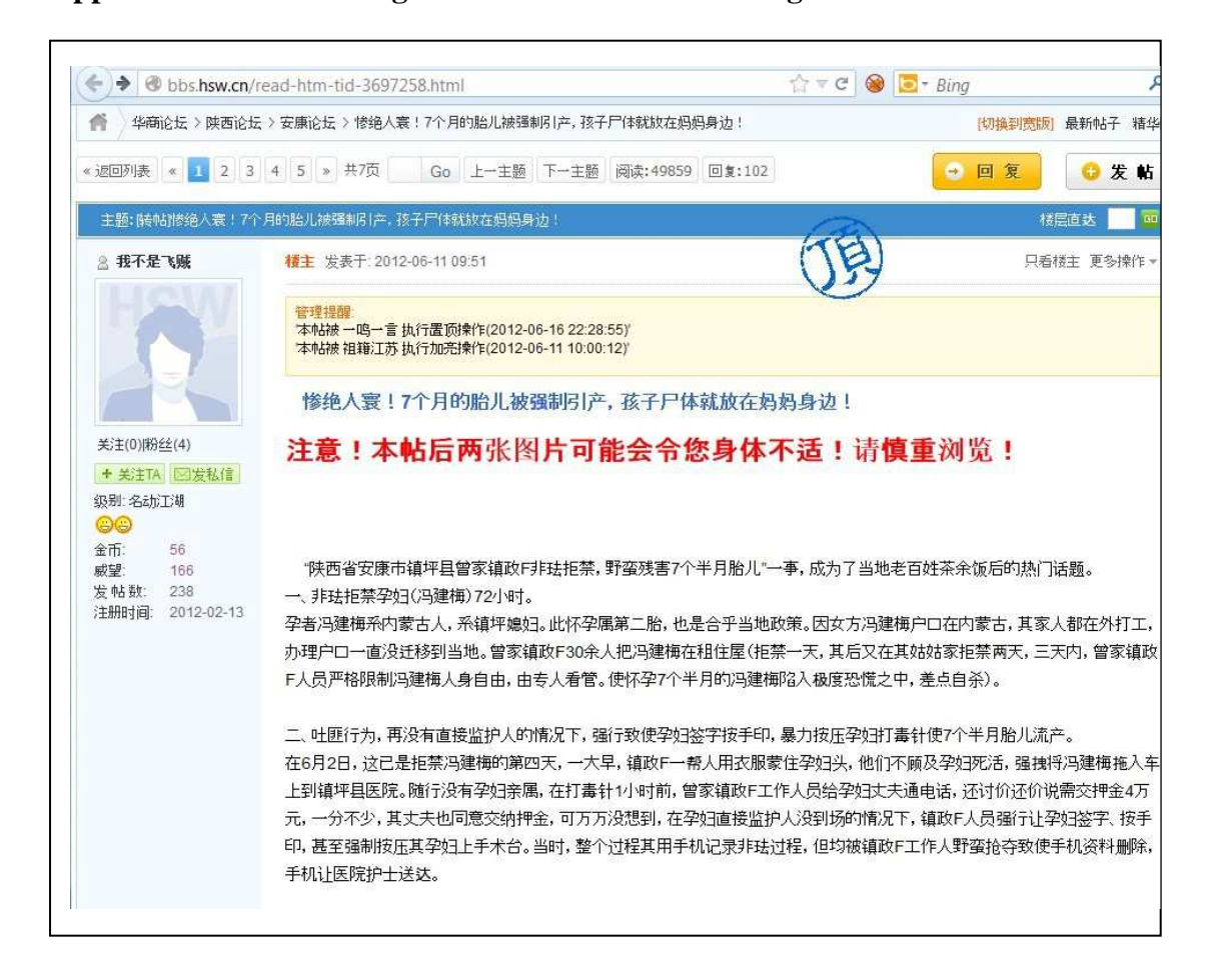
Appendix 3.1: The Management Role of Forum Manager

Source: "Canjue Renhuan! 7 Ge Yue de Taier bei Qiangzhi Yinchan, Haizi Shiti jiu Fangzai Mama Shenbian" (Such a Tragic! A 7 Month Baby Aborted by Force and the Dead Body Placed Right Beside Her Mom) http://bbs.hsw.cn/read-htm-tid-3697258.html, available Sept, 25, 2012. The light yellow area shows the operations of forum administrators. One administrator highlighted the posting on June 11, 2012, and another administrator pinned the thread to the top of the forum on June 16, 2012. For more information about the scandal, see "Wangbao Shaanxi Ankang Huanyun 7 Yue Yunfu Qiangzhi Yinchan" (Woman in Her 7-Month Pregnancy Forced to Abort in Ankang, Shaanxi Province According to Internet Sources), <a href="http://news.163.com/12/0612/18/83QP5TAI00011229.html">http://news.163.com/12/0612/18/83QP5TAI00011229.html</a>, retrieved Sept. 25, 2012.