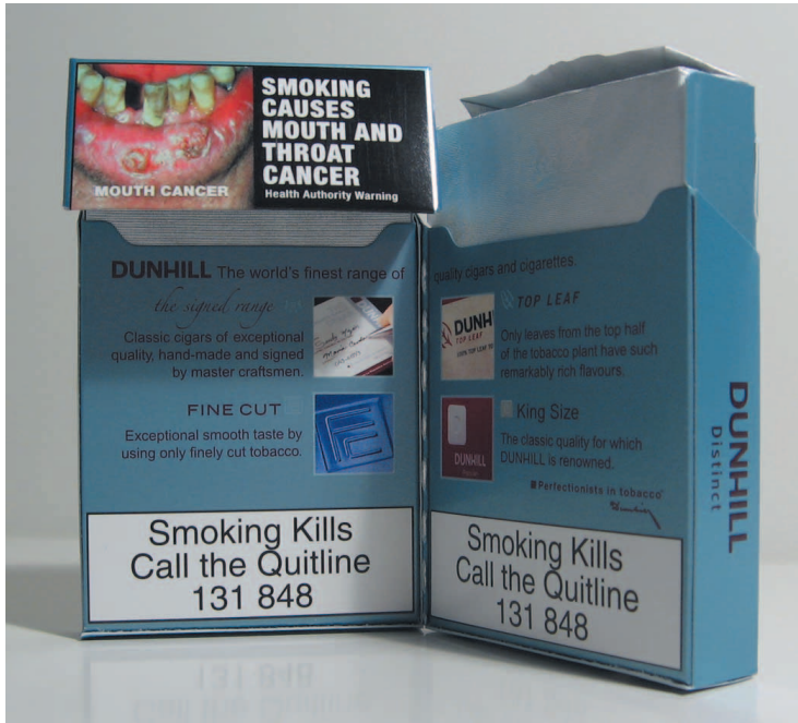
Figure 3 Split package of Dunhill cigarettes

Australia is a quintessential “dark market” where all tobacco advertising is banned. [56] Subtle changes to cigarette packs and trademarks were observed on both Benson & Hedges and Winfield cigarette packs during 2000-2002. [57] When researchers called the company to inquire about the changes, an employee said they were “playing with the logo because we can’t do any advertising anymore.” [57]