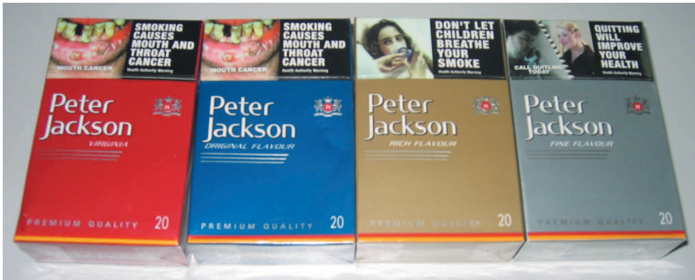
Figure 7 Australia: cigarette manufacturers substituted red for full strength cigarettes, blue and gold for milder and grey for light.

In nations where the deceptive descriptors “light” and “mild” have been banned, manufacturers have used packaging innovations to subvert the intent of those bans [69] where different colour gradations and intensities are used to perpetuate smokers’ understanding that a brand is allegedly lower or higher yielding. [14] For example, a popular Philip Morris brand in Australia, Peter Jacksons substituted colour coding including red for full strength, blue and gold for milder variants and grey for light. Derby Cigarettes in Brazil also substituted red for full strength cigarettes, blue for mild and silver for light . [70]