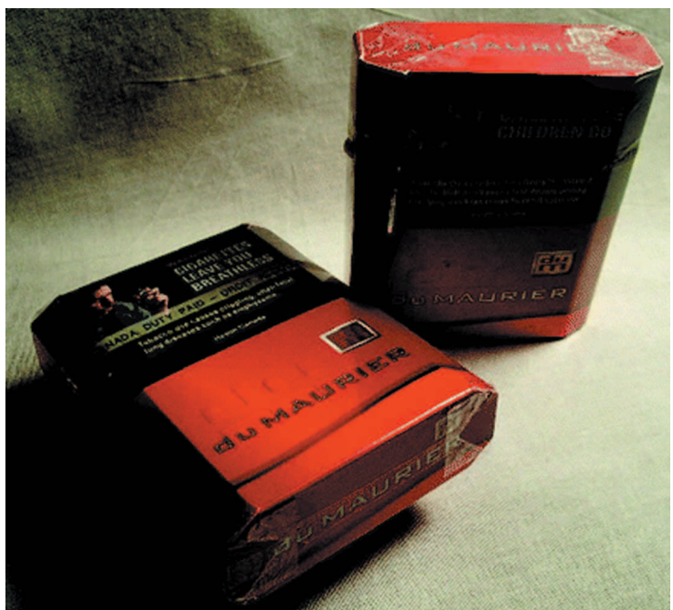
Figure 4 Octagonal packs for the du Maurier brand