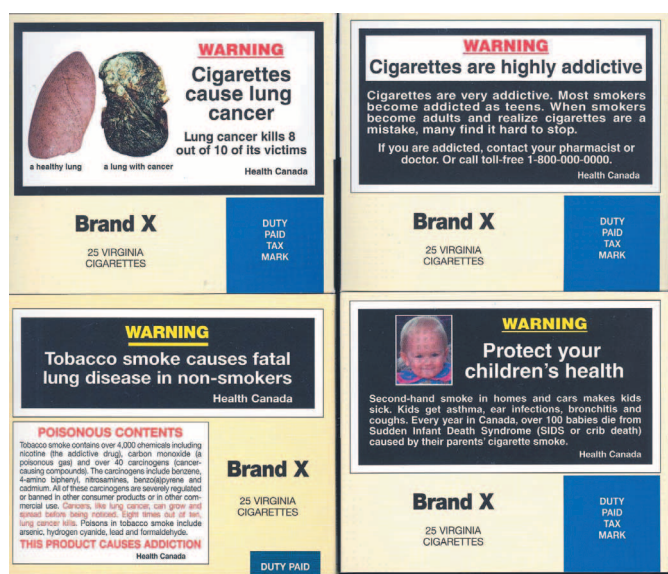
Figure 1 An example of cigarettes in proposed plain packaging