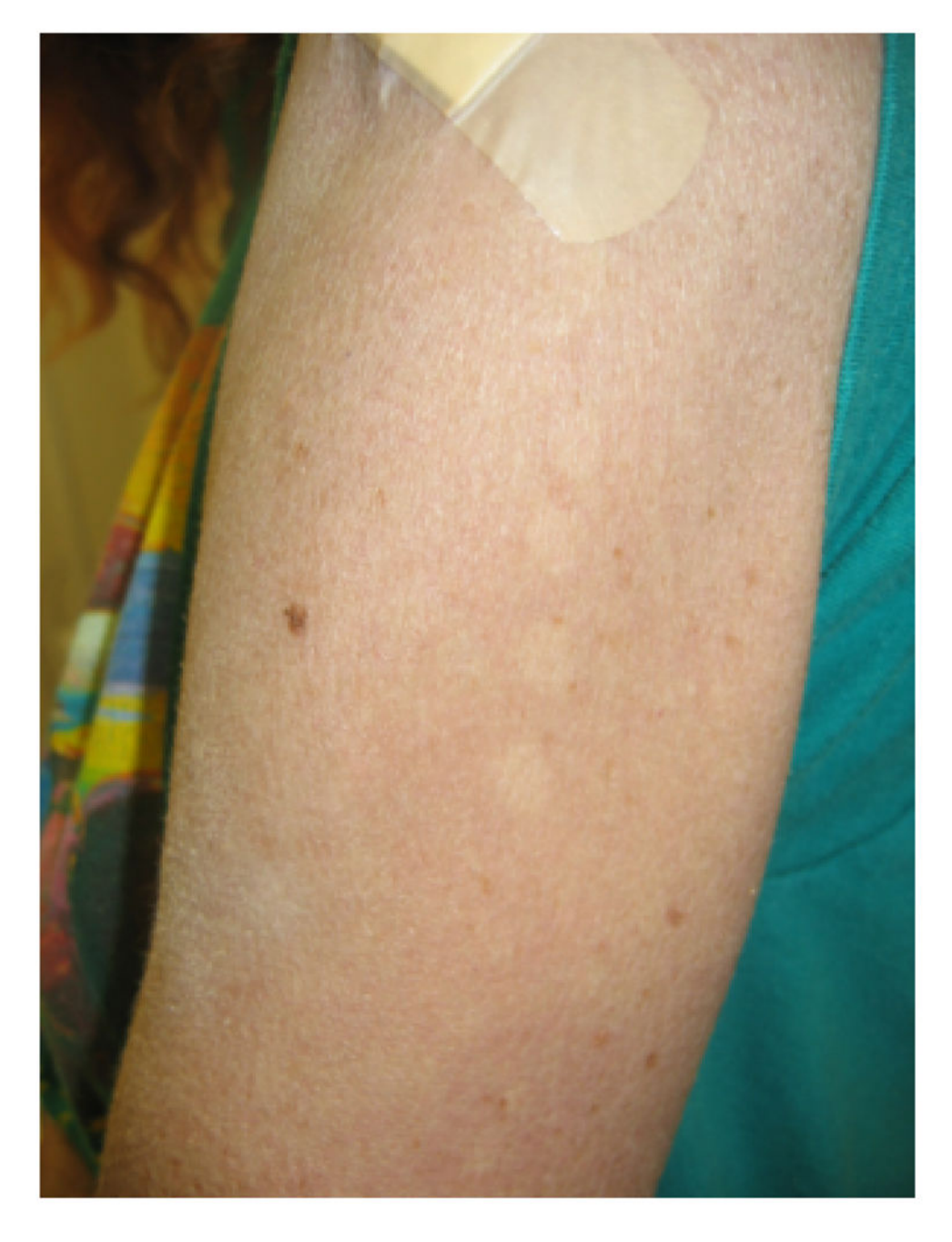
Figure 3. Lightening of left shoulder test spots noted 16 months after treatment with 755-nm laser.