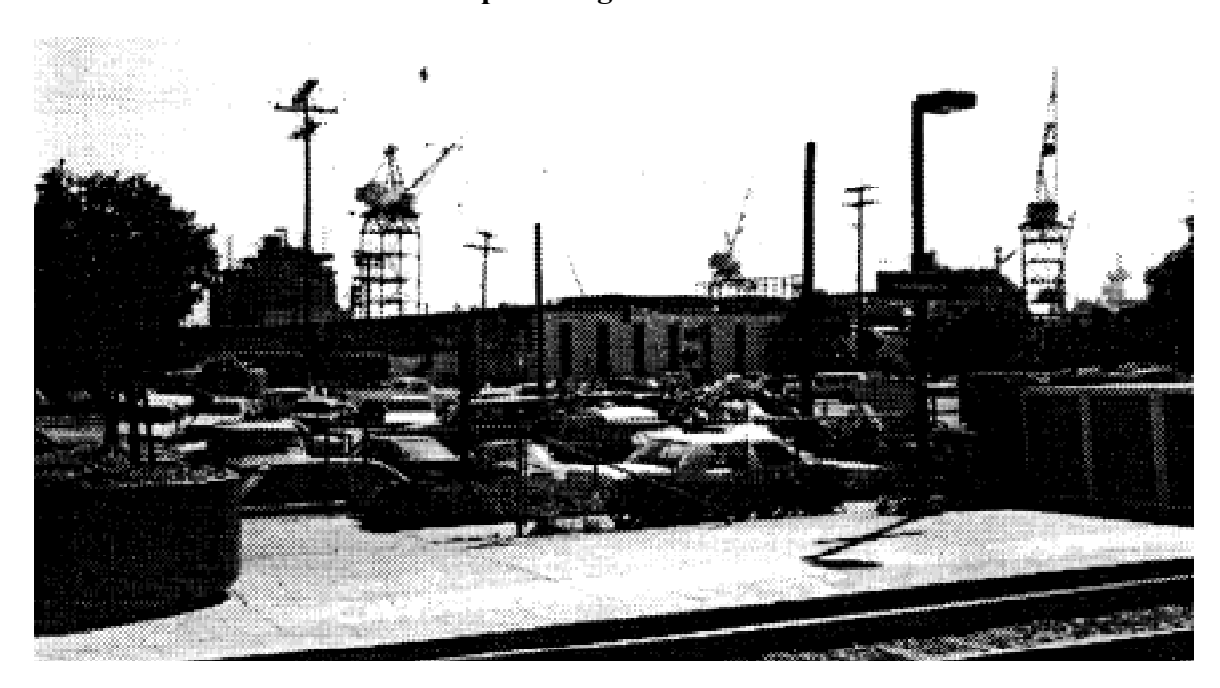
Figure 3: View from Harborside Station, looking west toward National Steel and Shipbuilding

In some cases, the character of existing land use near stations was cited as not being conducive to residential development. Roger Post, of National City, stated,