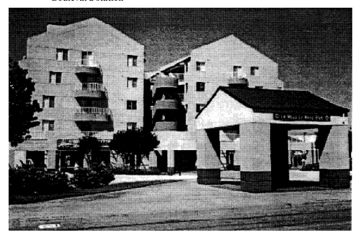
Figure 6: Villages of La Mesa residential development, as seen from Amaya Drive station