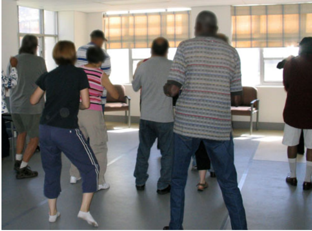
Figure 3. Inaugural dance class in progress. (Participants' heads are blurred).

PRRC, and the dance instructors worked with veterans enrolled in the WLA PRRC to test curricular strategies and document the success of class components, focusing on (a) increasing bodily awareness, (b) building a sense of movement mastery, (c) expanding individual/collective creative expression through movement and dance and (d) fostering a sense of community/social integration through creative dance-making activities. Dance for Veterans builds upon the progressive seated-to-standing class structure of Dance for PD , with emphasis on creativity, group sharing of authority over class content and social interactions. The class combines social and popular dance traditions, including Latin social dance forms, disco line dances and tap dance steps, with somatic movement concepts aimed at cultivating body–mind connectedness. This integrated approach is appealing to several generations of veterans, from recently deployed young men and women to those from the Vietnam era.