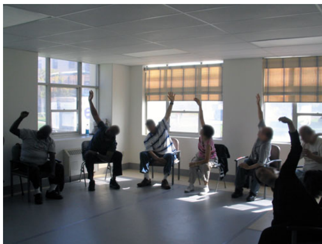
Figure 2. Inaugural class performing stretching exercises. (Participants' faces are blurred).

Having begun in the West Los Angeles Psychosocial Rehabilitation and Recovery Center (WLA PRRC) (Department of Veterans Affairs, 2011), Dance for Veterans now is being conducted in eight mental health programs at four VAGLAHS sites and in one affiliated Vet Center. During the inaugural year, Dr Ames, the psychiatrist in charge of the WLA