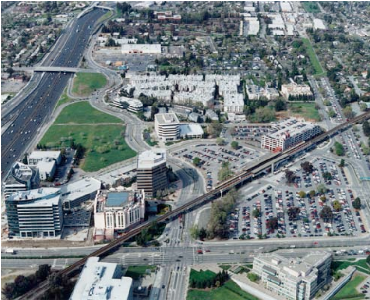
Figure 5-1. Pleasant Hill BART Station and Surroundings

This station is located in Contra Costa County and is surrounded by the communities of Pleasant Hill, Concord, and Walnut Creek, which allows for the investigation of the devices in different jurisdictions. There is limited bus and shuttle service in the area, and the devices could serve as an efficient feeder service from BART to the offices.