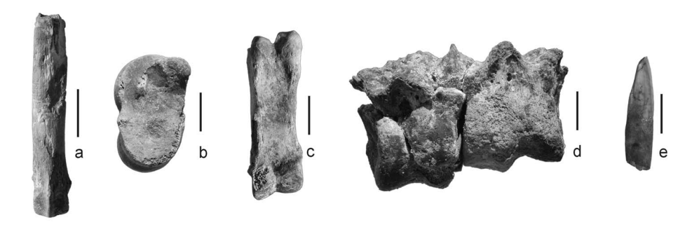
Figure 2. Selection of bones from Kom K and Kom W of each of the major domesticated animals. (a) Dog or wolf metapodial with cut marks (KK05-44) - volar view, (b) Sheep talus (KK03-27) - medial view, (c) Goat phalanx 1 (KK06-09) - volar view (d) Cattle distal metapodial (KK03-06) - dorsal or plantar view (e) Pig lower incisor (Kom W-back fill) - lateral view. Scale bar = 1 cm. Short legend: Bones from Kom K and Kom W of each of the major domesticated animals. doi:10.1371/journal.pone.0108517.g002

Hardly any data on ages at death are available for the cattle either. Kom K yielded one unfused distal metapodial, two fused first and one fused second phalanx. No reliable inferences can be made on this basis about slaughtering strategies, a recurrent problem for African archaeological sites that prevents demonstrating the use of cattle for secondary products like milk. Despite the lack of direct evidence, it has long been suspected that cattle milk was exploited by stock keeping communities of Africa from very early times [54,55,56,57]. In addition, from the Libyan Sahara there is now evidence through residue analysis of pottery for extensive processing of dairy products, although unspecified whether from cattle or caprines, during the Middle Pastoral period (approximately 5200-3800 BC) [58]. As is the case with the Fayum, the number of bones from domesticates at the site is extremely low compared to fish (Francesca Alhaique, Wim Van Neer, Monica Gala and Savino di Lernia, unpublished data).