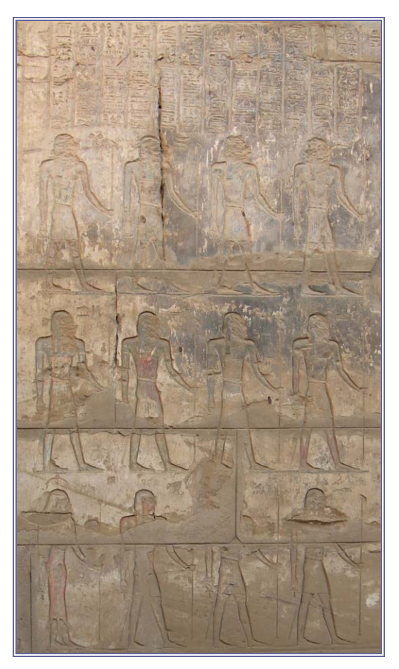
Figure 2. Twelve primordial deities at the temple of Khons, Karnak.

Equally elaborate cosmogonical systems were redacted, largely from preexisting text traditions, at the other major sacred sites of Upper Egypt during the time of the Ptolemies. These generally depict the local cult center as the point of first origin, the temple structure mythologically encapsulating the primeval mound of the earth. At Edfu, texts describe an island of sand, covered with a thicket of reeds, in the waters of chaos. Upon this island gather an assembly of Shebtiu creator-deities who have emerged from the surrounding waters; in their presence there appears a slip of reed, which forms a perch (djeba) upon which the original falcon-god comes to rest. This becomes the "seat of the first occasion" of the god. Thereupon follows the emergence of mythical sacred districts associated with the temple of Edfu, along