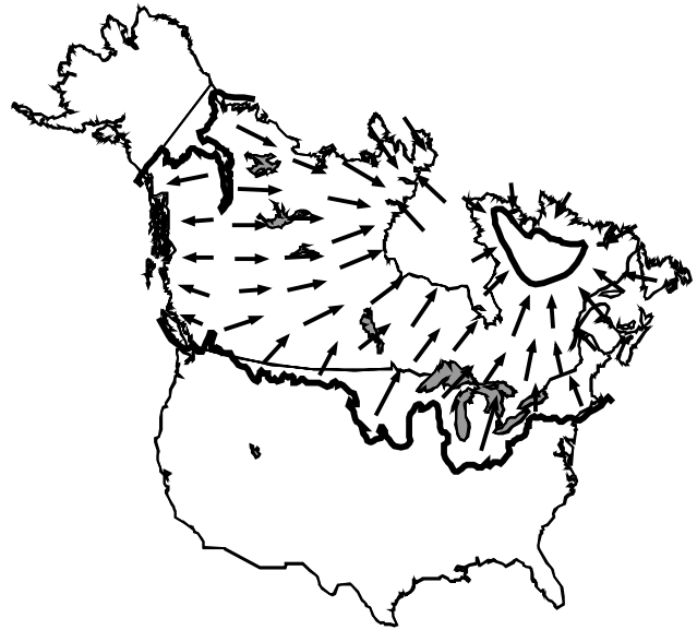
Fig. 1 The maximum extent of glacialiation during the most recent Ice Age (c. 20 000–6000 years before present). Also shown are the general pattern of glacial retreat up to c. 6000 BP and the last area remaining under ice in north-eastern Quebec prior to the complete melting of the ice sheet from the main continent between 7000 and 6000 BP. Parts of Alaska, although also glaciated, were excluded because we were uncertain of the detailed pattern of glacial retreat. Based on Dyke & Prest (1987).

The eighth variable represents the historical events associated with the most recent Ice Age and was also used to delimit the geographical scope of the study (Fig. 1). We used the temporal series of maps generated by Dyke & Prest (1987), supplemented with maps at http://members.cox.net/quaternary/nercNORTHAMERICA.html , showing the extent of ice