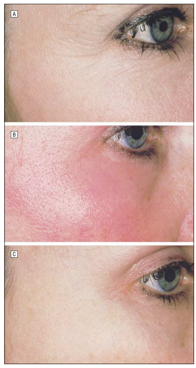
Figure 2. A 42-year-old woman with periorbital rhytides before treatment (A), immediately after nonablative skin rejuvenation using a 1.32-µm Nd:YAG laser in conjunction with cryogen spray cooling (B), and 6 weeks after nonablative laser skin resurfacing (C).

Laser Aesthetics (Auburn, Calif) developed a 1.32-µm Nd: YAG laser used in combination with CSC for nonablative skin rejuvenation. A multicenter study<sup>21</sup> evaluated periorbital rhytid improvement in 35 adults after 3 treat-